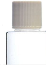
ALL DIMENSIONS IN MILLIMETRES