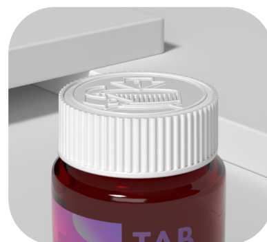
POLYPROPYLENE SCREW-ON CAP