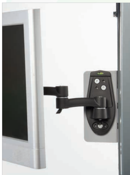
Adjustable monitor bracket.