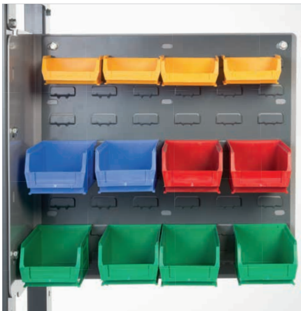
Adjustable storage bins for smaller packaging items.

Optional extras include adjustable storage bins for smaller packaging items, a fully adjustable monitor bracket and a 230v multiway socket bracket to provide a secure convenient location for connecting ancillary equipment.