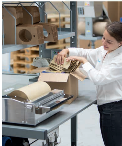
Generous workspace is ideal for complementary packaging.