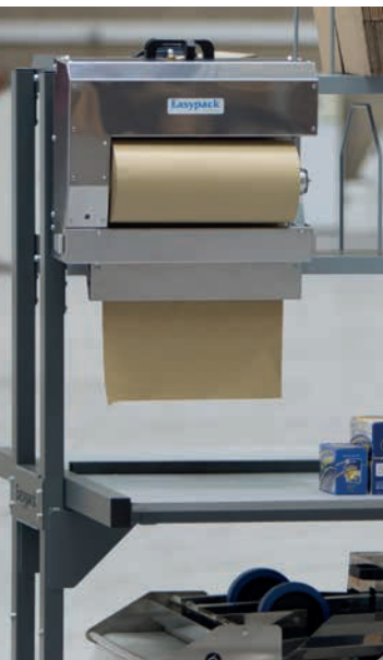
Optional freestyle™ system.