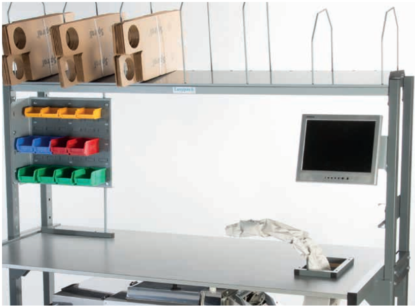
Single packstation™ showing tilting shelf feature.

The under-bench system produces strong, flexible, ready-moulded cushions from rolls of 100% recycled paper, directly through the chute, allowing you to pack a multitude of different goods with everything conveniently to hand.