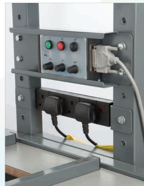
230v multiway socket bracket.

“packstation™ is a user-friendly system designed for comfort and efficiency”