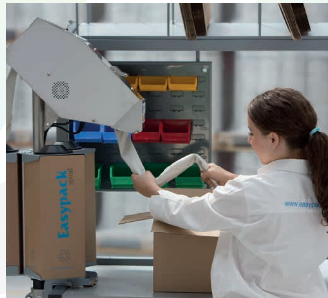
The spiral® systems provide both powered and non-powered options.

An optional shelf bracket allows you to securely attach alternative packaging systems, such as the freestyle™ system, which dispenses sheet paper on demand, allowing you to wrap or mould around goods directly into the box. A worktop clamp allows you to secure a spiral® dispenser, or a spiralpro® machine conveniently on the packstation™.