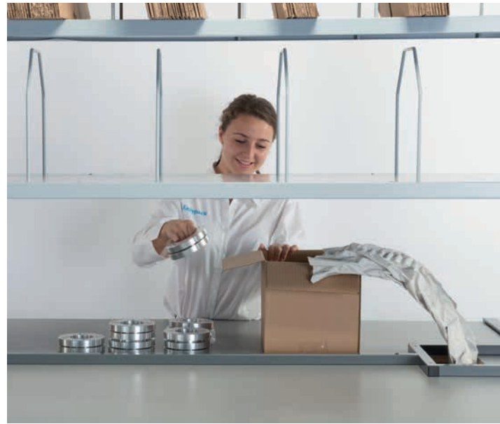
Double packstation allows multiple users to work efficiently together.