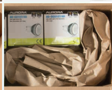
Each roll of paper converts up to 60 times its original volume, saving valuable warehouse space.

“packmate® is a flexible, easy to use system that provides strong, sustainable, void-fill packaging”