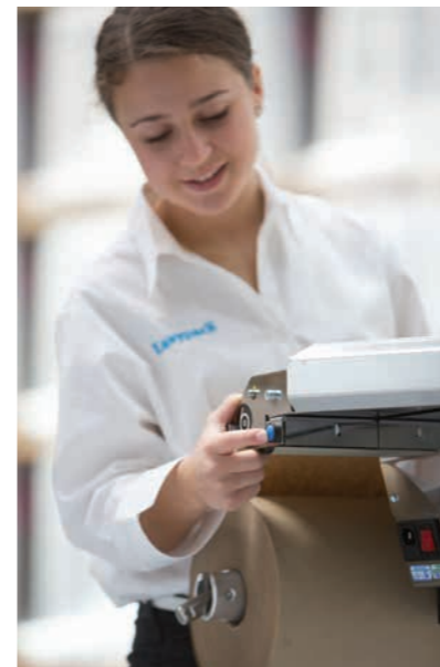
The system produces strong, lightweight paper cushions of variable lengths.