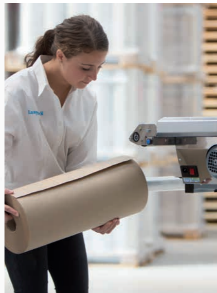
30 second paper loading speeds up efficiency.