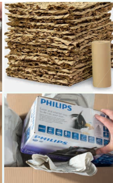
Sustainable paper cushion void-fill is clean, flexible and lightweight.