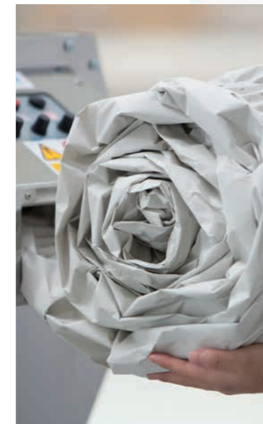
Our converted paper gives ultra-strong protection.