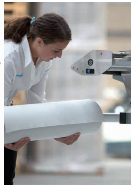
Easy paper loading.