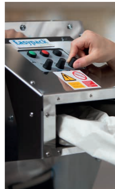
Easy to use control panel.