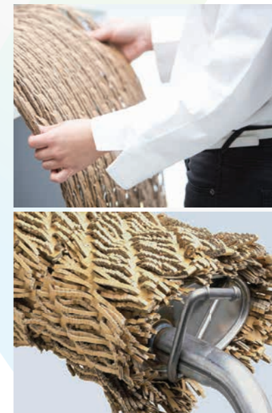
Free void fill enables you to save money and securely pack multiple goods.