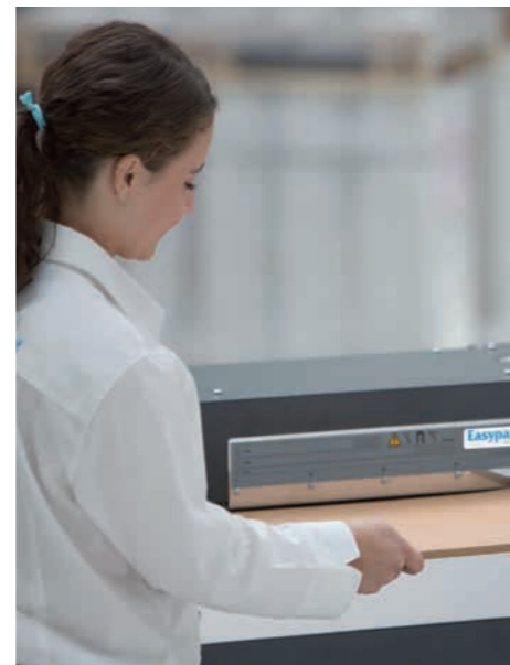
Recycle surplus cardboard to provide free packaging material.