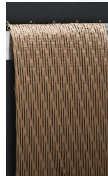
Up to 5m 3 of cardboard lattice material per hour.