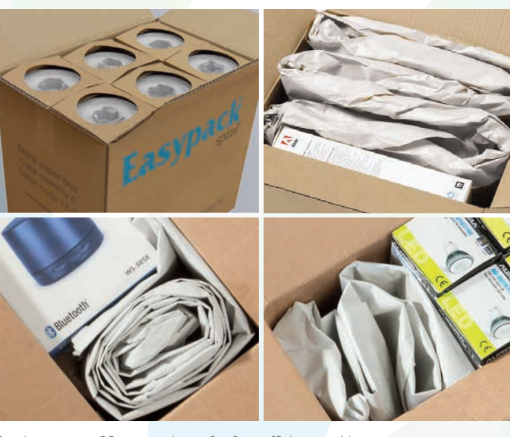
Produces up to 88m per minute for fast, efficient packing.