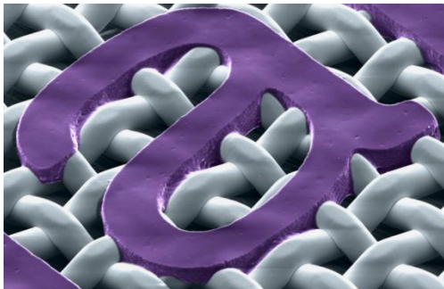
Figure 2: Swiss precision – close-up of a Gallus Screeny A-Line screen printing plate.

Basic prerequisites for making precision products include an intrinsic desire to fully understand all the ins and outs along with a steely determination to acquire all the skills required to ensure a perfect command of production and process steps down to the very last detail and produce items of the same reliable quality time and again. These same prerequisites also apply to innovations, because a perfect command of production and process steps in detail is essential for carrying out the changes required to create new products.