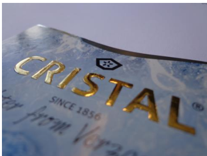
Figure: Metallic doming, a unique combination printing process based on rotary screen printing from Gallus

When it developed its own screen printing plates for rotary screen printing, Gallus also undertook to continuously develop and improve the technology behind the “Gallus Rotascreen” system solution. Tradition and precision are the cornerstones that have been helping Gallus to keep this innovation promise for 30 years. For example, the Gallus Screeny A-Line was launched midway through 2015 and is the most stable screen printing plate on the market. The metallic doming process is also currently being introduced in narrow-web label printing. This new and unique combination printing process from Gallus is based on rotary screen printing. In addition to this, the Tempo 120 project group has been founded with the aim of printing at a speed of 120 metres per minute for defined applications in combination printing (screen/flexographic printing).