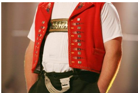
Figure 1: Swiss values are reflected in the traditional Swiss dress.

Quality awareness, organisation, conscientiousness, reliability and attention to detail are all traditional Swiss values that are reflected in the country itself and its products. Quality and perfection cannot be achieved overnight but require total long-term commitment to the relevant areas – and that's tradition.