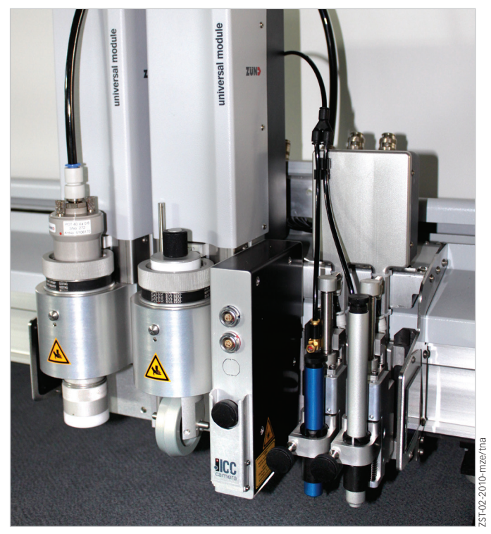
Fully equipped module carrier with 2 UM, ICC Camera and MAM-D.