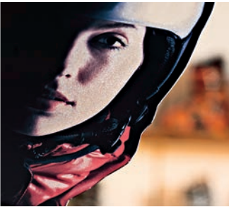
2 Hanging signs Contour-cut acrylic mobile, routed at unprecedented speeds thanks to optimized vacuum hold-down.