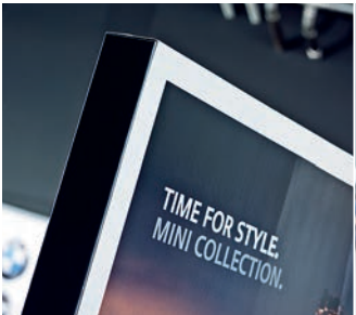
1 Floor display

Creative and low cost – these are vital attributes in designing displays for retail, showroom and exhibit applications. The Zünd cutter puts new ideas in overdrive, removing all limits to creativity and choice of materials. Rigid, flexible, and folding stock offer endless possibilities. With Zünd, finishing becomes both easy and profitable.