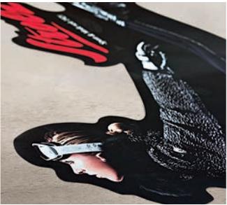
3 Floor graphics Laminated adhesive-backed vinyl, kiss-cut and through-cut, for floor decals and floor mats.