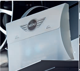
3 Presentation kit

Thick corrugated and composite board made foldable. The Zünd v-cut tool at its best.