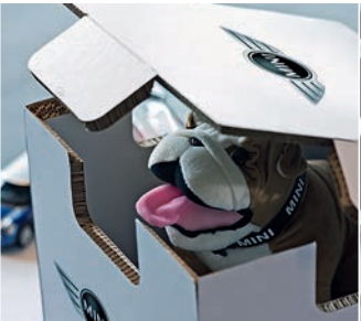
2 Store decor & furnishings

Pop-up, roll-up and cardboard displays cut and creased. Perfect for folding panel displays and stand-ups in showrooms and store windows.