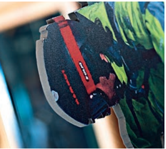
4 Displays Cut or routed lightweight POP/ POS materials up to 50 mm/2” thick. Ideal for in-store decorations.