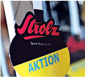
1 Shelf signage Contour-cut polypropylene shelf talkers for in-store promotions and window displays.

In today’s competitive environment, eye-catching shapes and unusual materials are in high demand. Zünd’s latest camera-guided cutting and routing technologies are capable of meeting these requirements better than ever. Structural designs, contour-cut displays – Zünd cutters will finish all varieties of common and newly developed materials easily, efficiently, and economically.