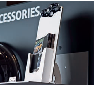
4 Brochure holder

Polypropylene case and packaging. Example of structural design, with contour-cuts and creases.