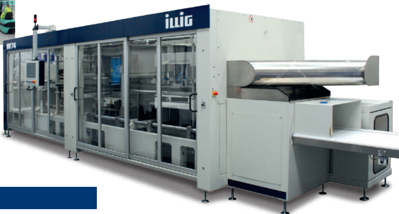
The latest addition to our thermoforming machine line up.