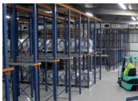
Our 600 pallet capacity finished goods warehouse.

Incorporated in 1973, Macpac has always had an eye on the future continually striving to combine innovation, engineering and practicality into everyday solutions. Our machine park of 11 ultra modern thermoformers makes us one of the largest privately owned thermoforming businesses in the UK. Our longevity speaks for itself, it says a lot about who we are.