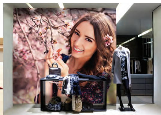
In-store communication - backlit