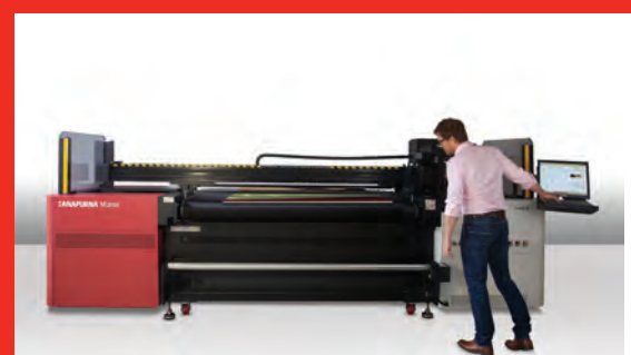
Anapurna M2050i prints rigids or rolls at top class productivity.