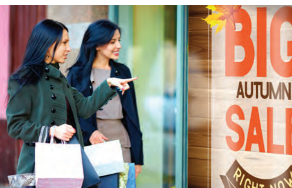
In-store communication - paper