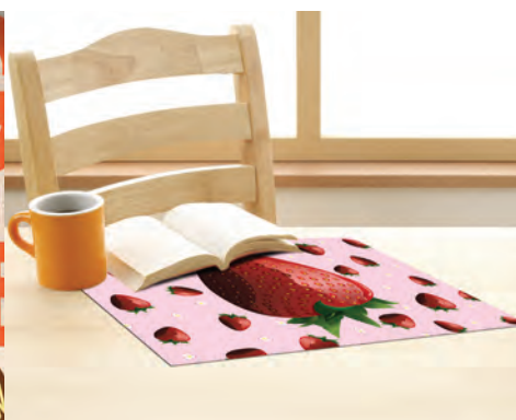
Household communication - mireco