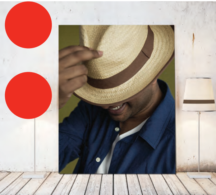
In-house decoration - dibond

White ink creates new possibilities for printing on transparent material for backlit or backlit/frontlit applications or printing white as a spot color. You might even consider printing images on dark substrates using white ink only. Stand out and let Anapurna M2050i differentiate your decoration and communication jobs.