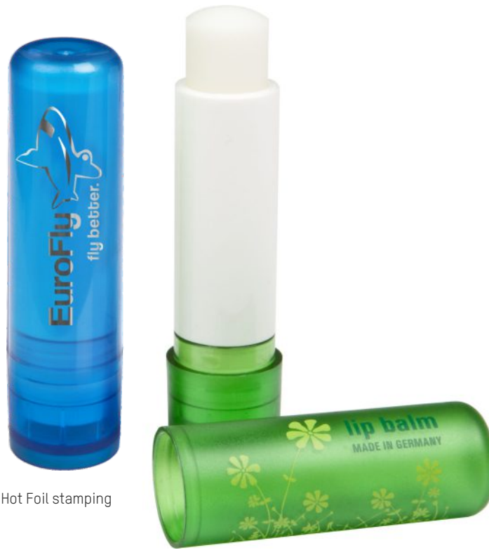
Hot Foil stamping