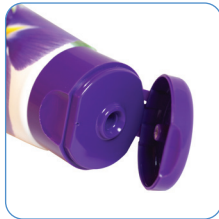
Glossy & Matte

STAND UP, SCREW-ON CYLINDRICAL + ELLIPTICAL