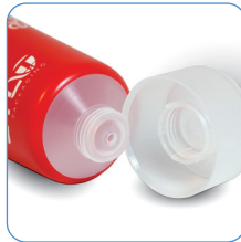
Glossy & Matte

STAND UP, SCREW-ON CYLINDRICAL + ELLIPTICAL