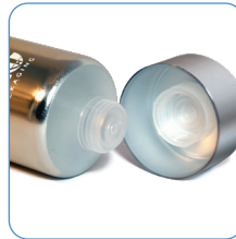
Glossy & Matte

METALLIZED/SPECIALTY OVER SHELLS AVAILABLE