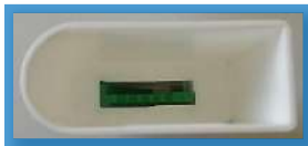
SINGLE CONVEYOR WITH MANUAL INSERTION

30/0012_ (body) – 30/0015 (conveyor) – 30/00012-C (body with conveyor included) – 30/0003_ (trigger) – 30/0004_ (rounded lid) – 30/0004P_ , 30/0009_ (flat lid)