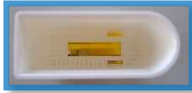
CONVEYOR ALREADY INCLUDED INTO THE MOULD