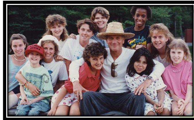
Hole in the Wall Gang Camp Founder Paul Newman with the kids