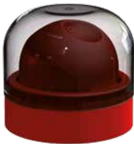
with an over cap

Plasticum developed a proprietary spray solution with a patented technique, integrating both the actuator and insert. The spray orifice of the button is positioned just above the stem to optimise the control and performance when activating the aerosol. A special chamber and channel design stimulate the acceleration of particles into a swirling pattern.