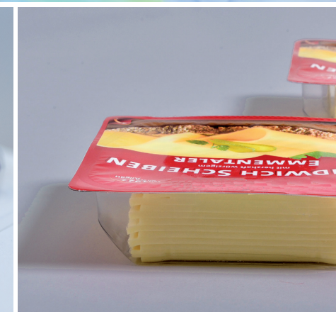
A&D SAMPLE APPLICATIONS.