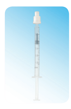
Nasal Spray Adapter für Syringes with Luer Lock connection. An economic solution for applying e.g. vaccines.