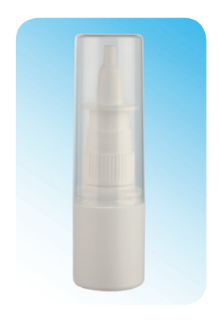
Nasal Spray System complete Packaging available with screw-on and snap-on closure. Due to the pump's modular construction system, high level of customization possible.