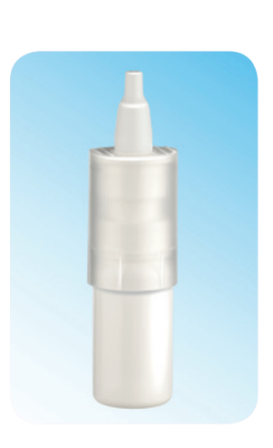
Nasal Spray System with actuation guide eases nostril spray appliance.