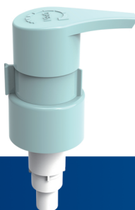
150DUC 24/410 &amp; 28/410