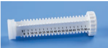
80cc Dial-A-Dose plunger