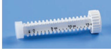
15cc Dial-A-Dose plunger