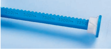
6cc Posi-Dose plunger

Choose a Dial-A-Dose or Posi-Dose plunger for measured multi-dose use. Sample plunger calibration marks shown below. Custom colors and calibrations available.