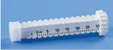
30cc Dial-A-Dose plunger