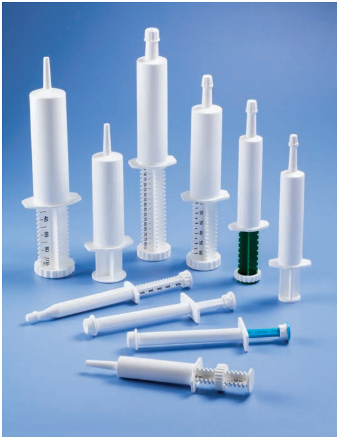
Dial-A-Dose and Posi-Dose syringes allow users to select exact dosing amount.

Single and multi-dose packaging solutions