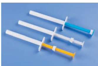
Posi-Dose is designed for oral dewormers.