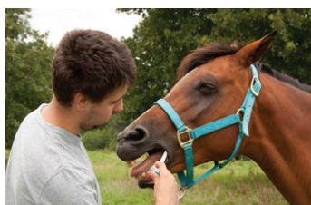
Available in single and multi-dose options.

Nordson EFD offers a comprehensive selection of dosing syringes used in the treatment of horses and other animals.