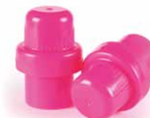
P66 48mm For PET Neck / 66ml capacity