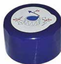
CL28 28/410 PET Neck