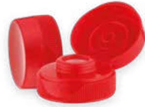
CM-FT-13 38/400 Ribbed