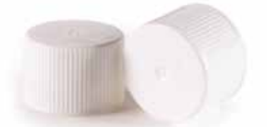
Child Resistant Cap S30 PE Neck