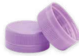
1P905 TE Aseptic 38MM