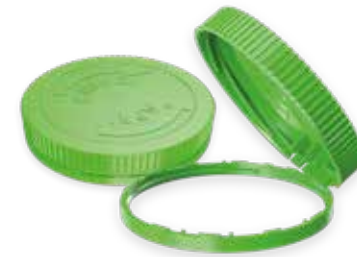
1P41 Tethered Cap 38MM