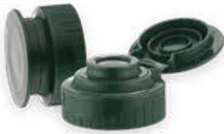
CM-FT-13 38/400 Ribbed