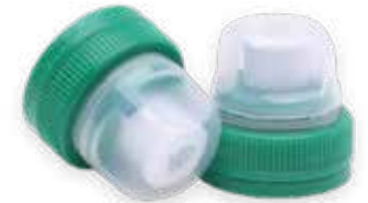
1P993 Aseptic 2 38MM