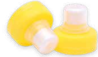
1P991 Aseptic 2 38MM