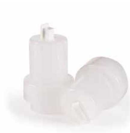
C38 PET Neck / 32ml capacity