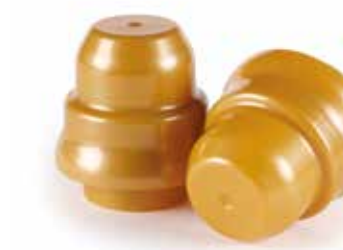
Z38 38mm For PET Neck / 35 ml capacity