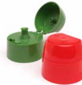
Piano Series Custom Neck