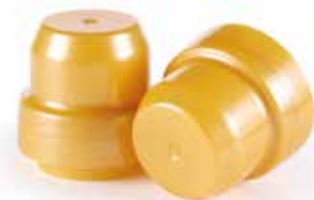
D48R 48mm For PET Neck / 55ml capacity