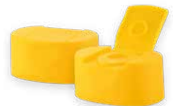
CM-FT-2 20/410 Smooth