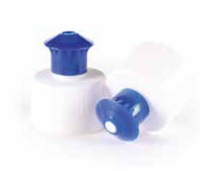
P/P PCO Variety of Sizes & Options