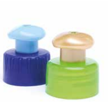
Diva Series 28/410