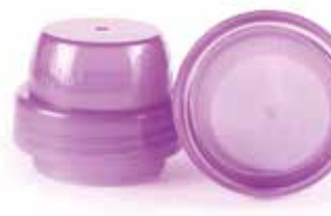
S44 For PE Neck / 100ml capacity