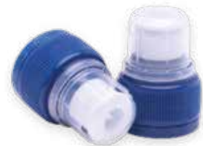
1P983 Push Pull Aseptic 2 28MM