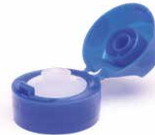
Adagio Series 28/400