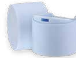
CM-DC-7 24/410 Double Wall Smooth