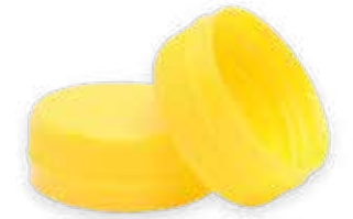
1P854 Aseptic 38MM