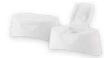
CM-FT-13 28/410 Smooth