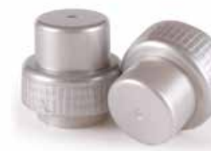
045 For PE Neck / 30ml capacity