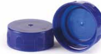
G44 Variety of Sizes & Options