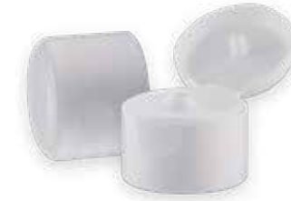
CM-FT-4 28/410 Smooth