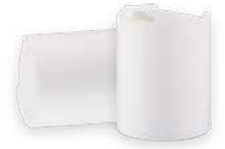
CM-DC-6 24/415 Smooth