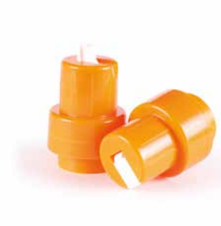
C43 PE Neck / 35ml capacity