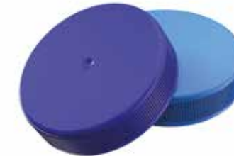
48mm Continuous Thread Cap