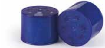
Child Homologated Resistant Cap SC28 28mm PET Neck