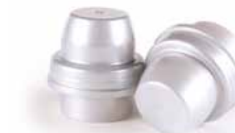
P68 For PE Neck / 70ml capacity