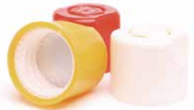
Child Proof Cap Coro Series Variety of 28/410 Sizes