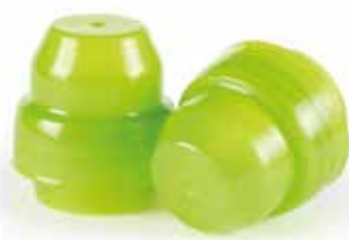
N38 For PE Neck / 38ml capacity