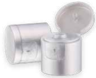
CN-FT-3 20/410 Smooth