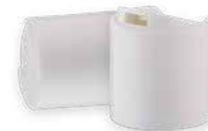
CN-DC-7.8 24/410 Smooth