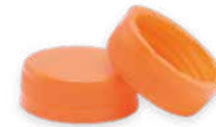
1P853 TE Aseptic 38MM