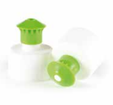
01 Variety of Sizes & Options