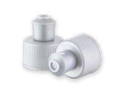
CL-PP-5 24/410 Ribbed