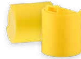
CM-DC-5 20/410 Smooth