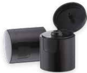
CN-FT-4 24/415 Smooth