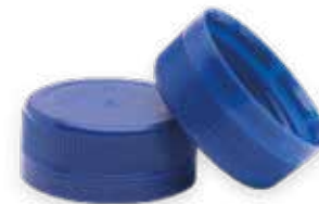
1P651 TE Aseptic 38MM