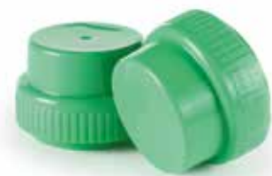
M54 For PE Neck / 54ml capacity