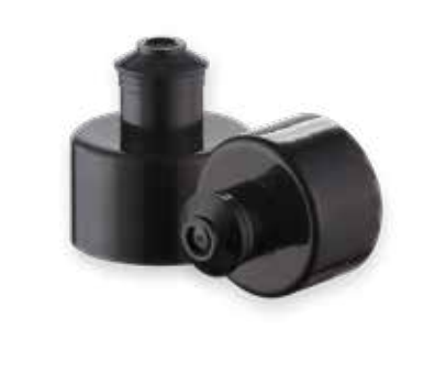
CI-PP-5 28/410 Smooth