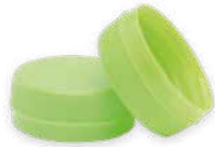
1P855 Hot Fill 38MM