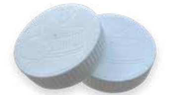
53mm Child Resistant Cap 53/400