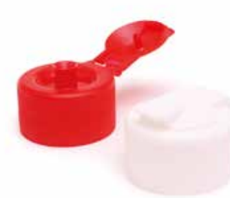
Aria Series 28/410 Ribbed or Smooth