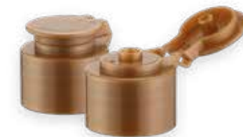
CM-FT-5 24/410 Smooth