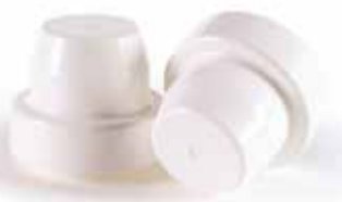
N52 For PE Neck / 62ml capacity