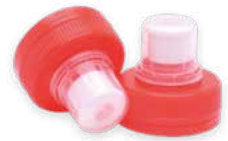
1P985 Aseptic 2 38MM