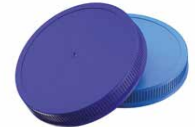
100mm TaperStack™ Caps