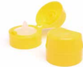
Basso Series 28mm Snap On