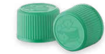
CM-SC-V 24/410 Ratchet