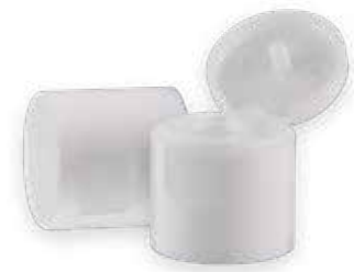
CM-FT-3 20/415 Smooth