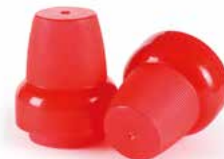
B44 For PE Neck