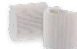
CN-DC-7.8 28/410 Ribbed