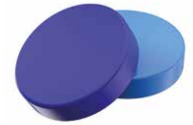
70mm Continuous Thread Cap