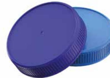
89mm TaperStack™ Caps