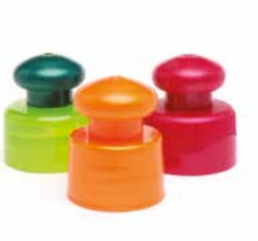
Opera Series Variety of Sizes Available