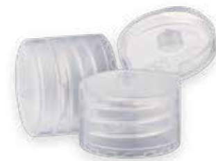
CN-FT-4 20/410 Smooth