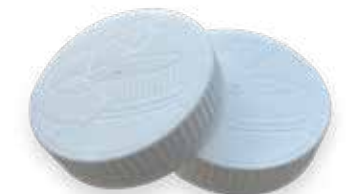
63mm Child Resistant Cap 63/400