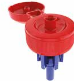
Measured Dose Device 28/400