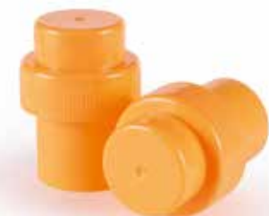
S38 38mm For PET Neck / 35ml capacity