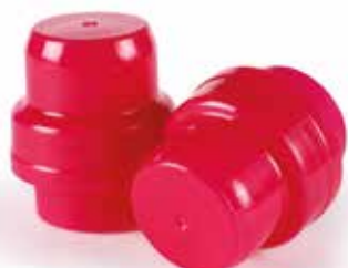
N40/2 For PE Neck / 37ml capacity