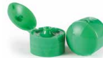
PET28 28/410 PET Neck