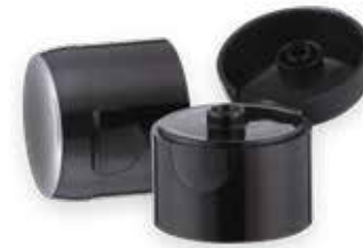
CM-FT-5 28/410 Smooth