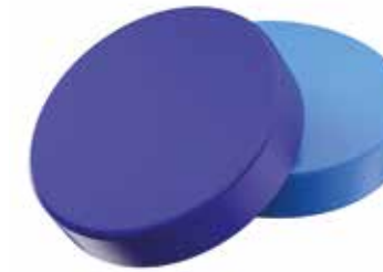
67mm Continuous Thread Cap