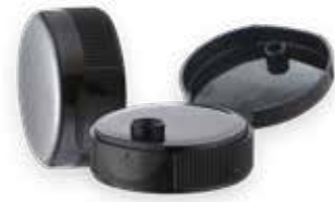
CM-FT-6 38/400 Smooth