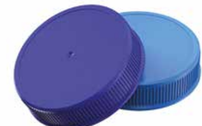
70mm TaperStack™ Caps