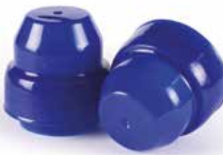
N46 For PE Neck / 30ml capacity