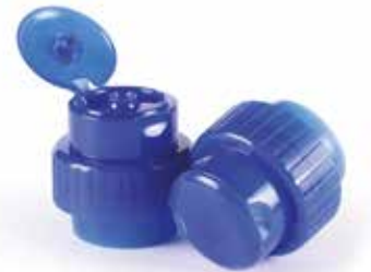
F38 38mm PET Neck