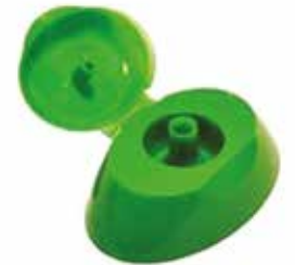
CREMA PE Neck