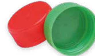
1P402 NO TE 38MM