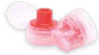
1P915 Flip Top 26MM