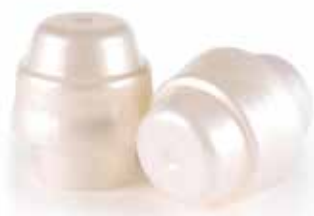
MD46 For PE Neck / 43ml capacity