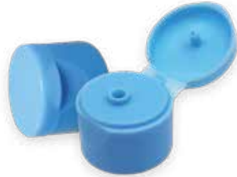
CM-FT-14 32/410 Smooth