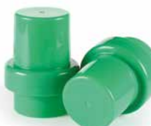
S55L For PE Neck / 70ml capacity