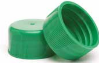
Fiato Series 28/410