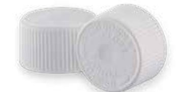
CM-SC-T 24/410 Ratchet