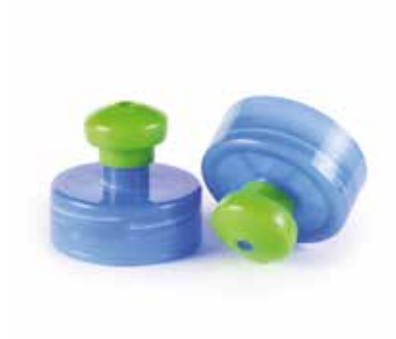
PO38L Variety of Sizes & Options