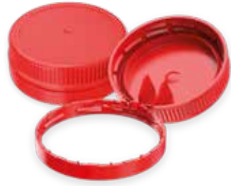
1P26 Tethered Cap 38MM