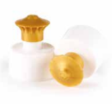
01/03 Variety of Sizes & Options