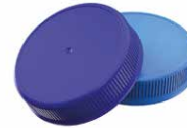
63mm TaperStack™ Caps