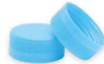
1P10 TE 38MM