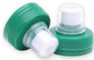
1P984 Aseptic2 Anti-Choking 38MM