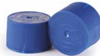
Child Homologated Resistant Cap S40 PE Neck