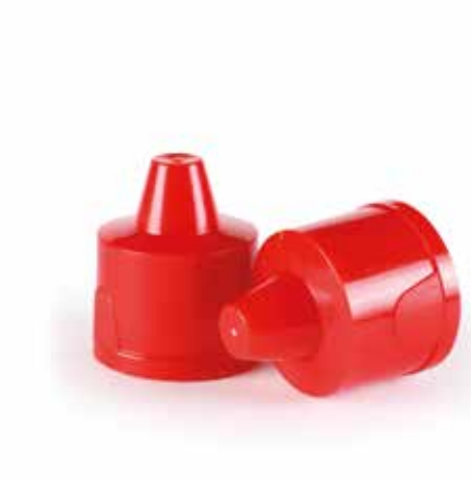
S32 PE Neck