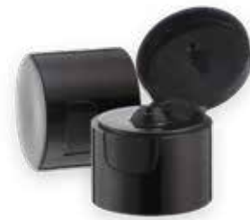
CN-FT-3 24/410 Smooth