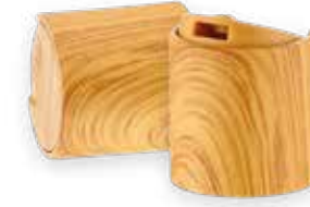
CM-DC-6 24/410 Water Transfer