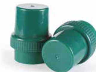
055 For PE Neck