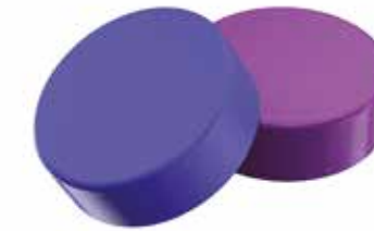
33mm Continuous Thread Cap