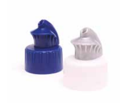
Tono Series 28/400 Smooth or Ribbed