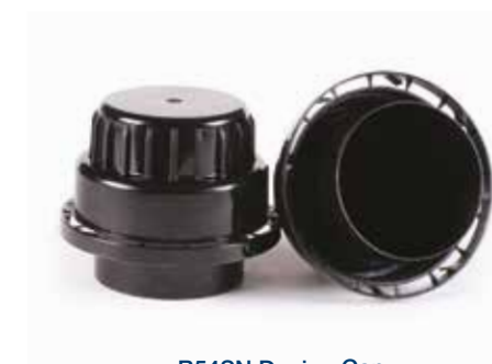
B54SN Dosing Cap PE Neck