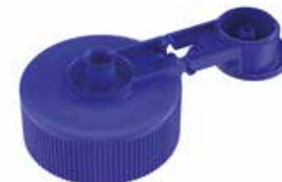
28mm Flip Top 28/400