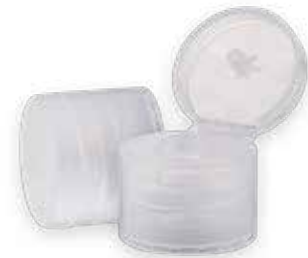
CN-FT-3 20/415 Smooth