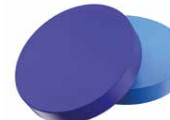
89mm Continuous Thread Cap