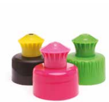
Canto Series 28/410