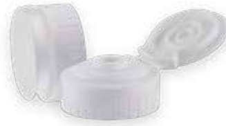
CM-FT-8 38/400 Ribbed