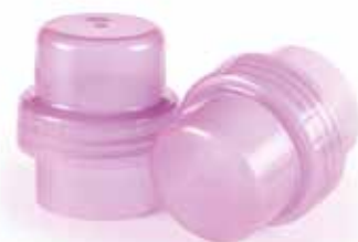
G55 For PE Neck / 75ml capacity