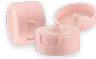
CM-FT-3.4 24/410 Double Wall Smooth