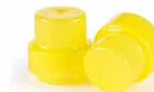
B138L 38mm Neck / 24ml capacity