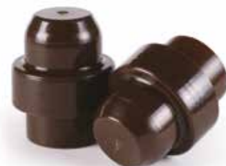
I38 38mm For PET Neck / 30ml capacity