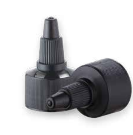
CM-NC-3 24/410 Ribbed