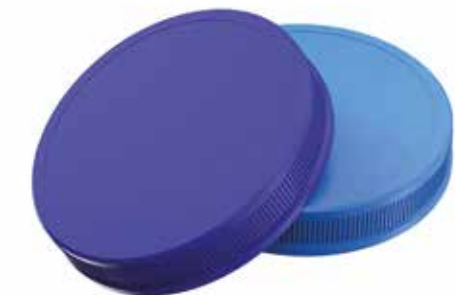
120mm TaperStack™ Caps