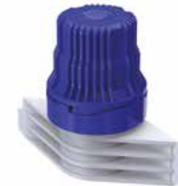
Pouch Fitment Cap Tamper Evident