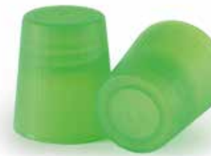
T39 For PE Neck / 30ml capacity