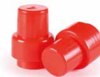
021V For PE Neck / 40ml capacity