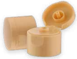
CM-FT-3 24/410 Smooth