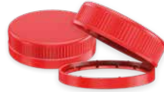
1P27 Tethered Cap 38MM