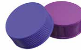
28mm Continuous Thread Cap