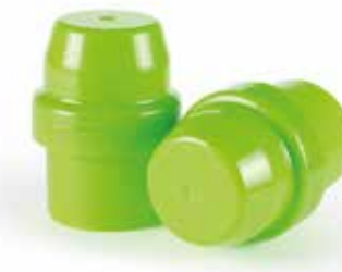
N50 For PE Neck / 100ml capacity