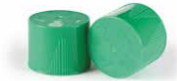
Child Resistant Cap S28 28mm PET Neck