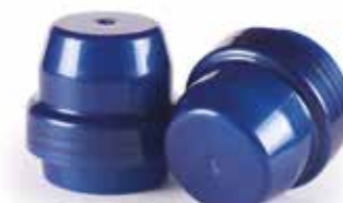
N75 For PE Neck / 75ml capacity