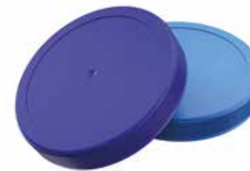
63mm Continuous Thread Cap