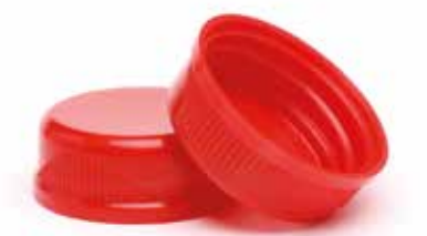
Vibrato Series 28/400