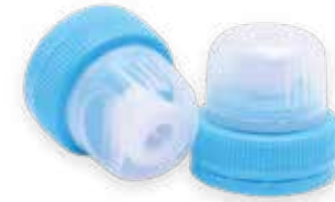
1P992 Aseptic 2 38MM