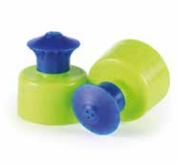
01PET Variety of Sizes & Options