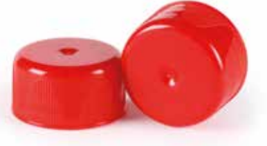
G28 Variety of Sizes & Options