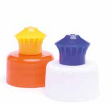
Accordo Series 28/410