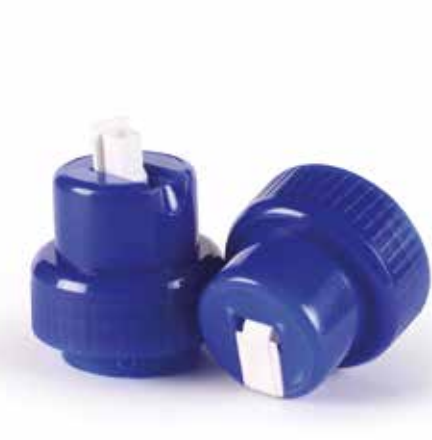
C45 PE Neck / 28ml capacity