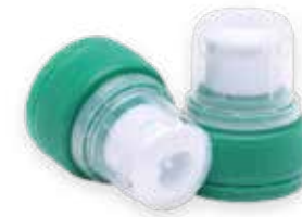
1P998 Push Pull Aseptic 2 28MM