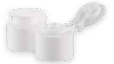
CM-FT-4 20/410 Smooth