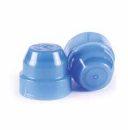
S41/2 PE Neck