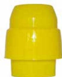
N60 For PE Neck / 100ml capacity