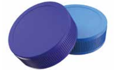
53mm Continuous Thread Cap