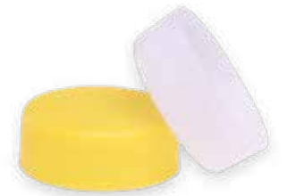
1P20 TE Aseptic 38MM