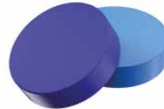
45mm Continuous Thread Cap