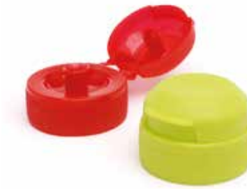
Tema Series 28/400