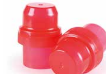
S48 48mm For PET Neck / 80 capacity