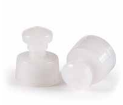
K01PET Variety of Sizes & Options