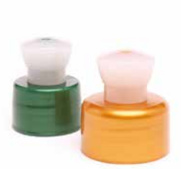
Nota Series 24/410 & 28/410