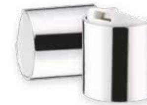
CS-DC-7.7 24/410 Metalized