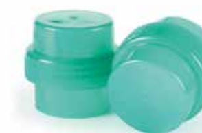
B54SN For PE Neck / 60ml capacity