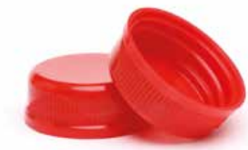
PS28 Variety of Sizes