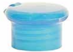
SLV28 28/410 PET Neck