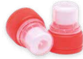
1P988 Push Pull Aseptic 2 28MM