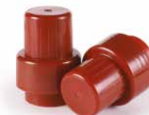
021 For PE Neck / 40ml capacity