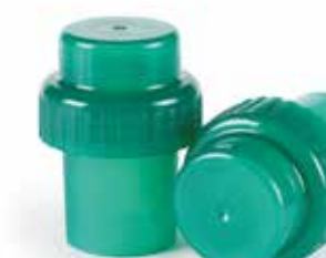
D40 For PE Neck / 30ml capacity