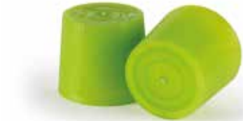
Child Homologated Resistant Cap S41 PE Neck