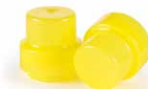
B138 38mm For PET Neck