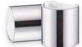
CM-DC-7.8 24/410 Aluminum