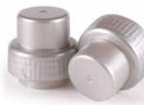
045G For PE Neck / 30ml capacity