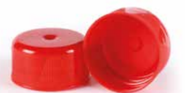
P28 Variety of Sizes & Options