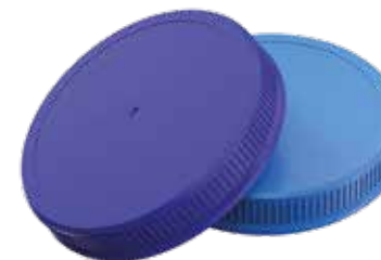
83mm Continuous Thread Cap