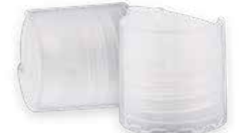
CN-DC-7.8 28/410 Smooth