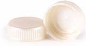
B28 Variety of Sizes & Options