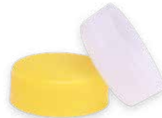
1P22 TE Lightweight 38MM