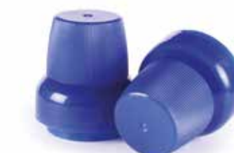
061 For PE Neck