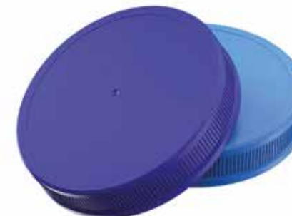
110mm TaperStack™ Caps