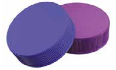
38mm Continuous Thread Cap