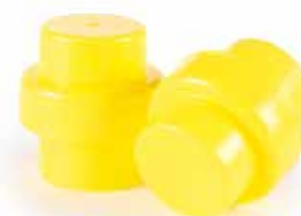
P48 48mm For PET Neck / 50ml capacity