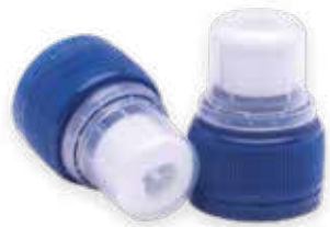
1P982 Push Pull Aseptic 2 28MM