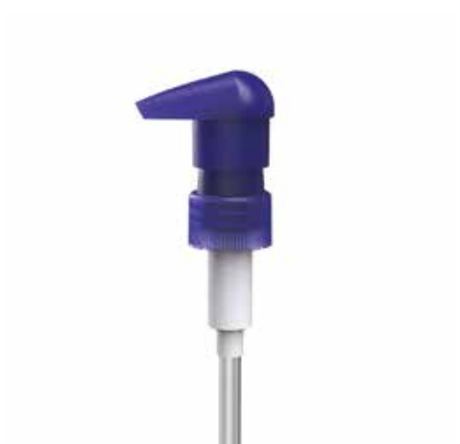
Visor (4cc) Dispensing Pump