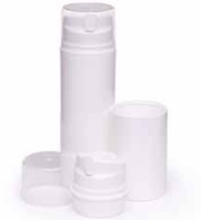
Airless Round Slim Dispenser