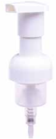
F11 Dispensing Foamer