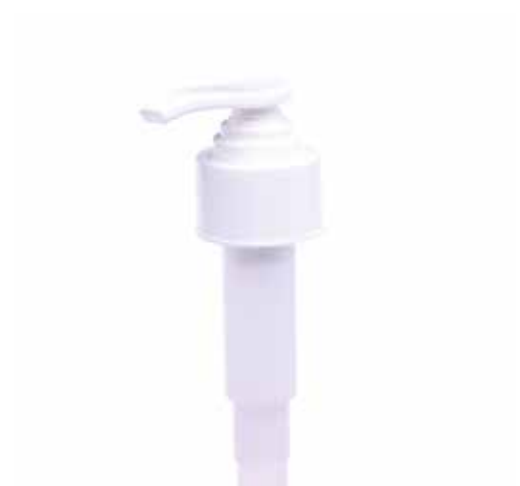
RS-5 Lotion Dispensing Pump RS Series