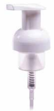
F6 Dispensing Up-Lock Foamer