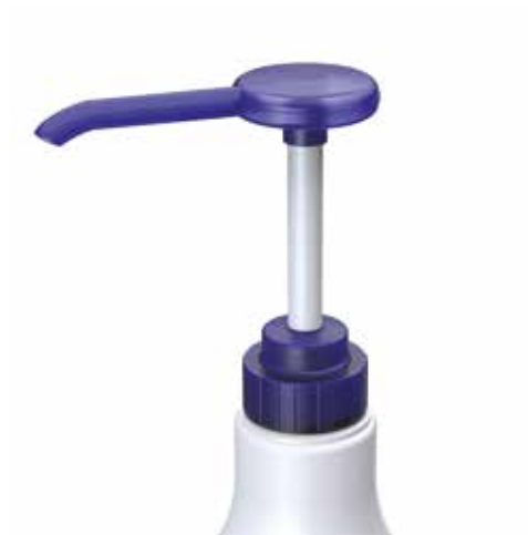
RS-30 Dispensing Pump