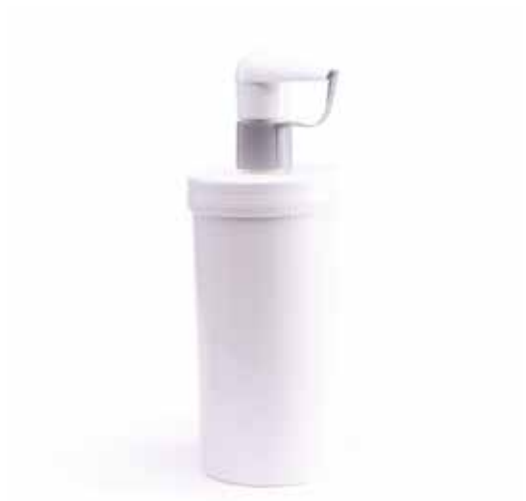
HVDS High Viscosity Dispenser System