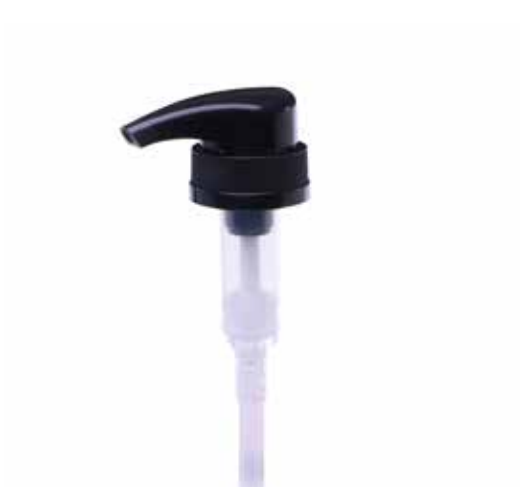
RSS-40 Lotion Dispenser Pump RSS Series