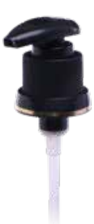
LDS-1/3 - Lotion Dispensing Pump LDS Series