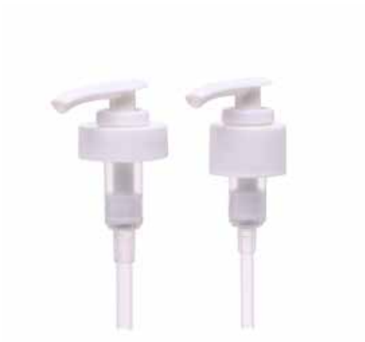
RS-4 Lotion Dispensing Pump RS Series