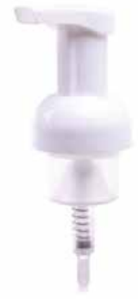
F3 Dispensing Foamer