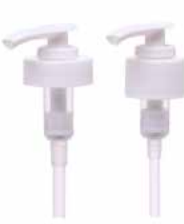
LDS-2 Lotion Dispensing Pump LDS Series