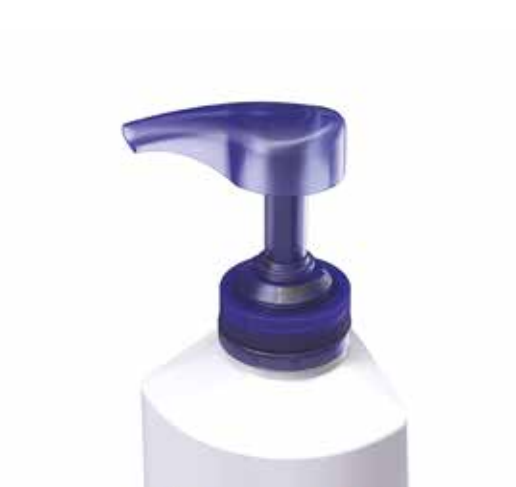
RS-4e Lotion Dispensing Pump RS Series