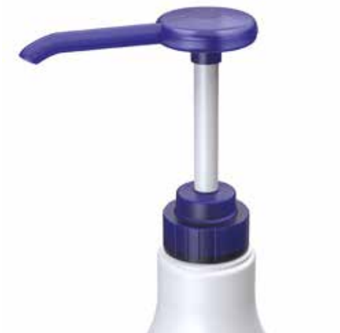
Hybrid Dispensing Pump