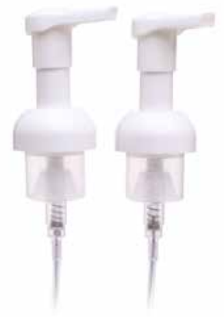
F1 Dispensing Up-Lock Foamer