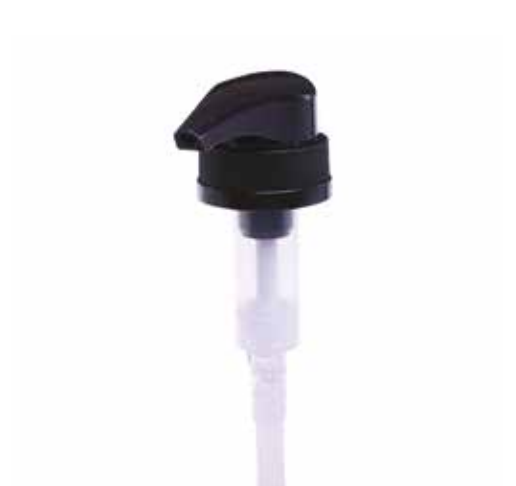
RSS-35 Lotion Dispenser Pump RSS Series