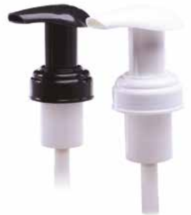
PF-17 Dispensing Up-Lock Foamer