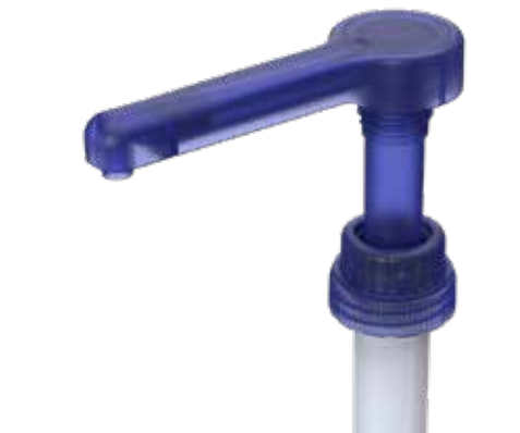
RS-15 Dispensing Pump