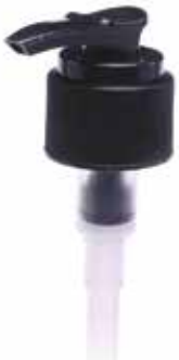
Lotion Dispensing Pump LPX Series