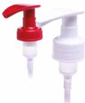
Nautilus Spring Pump Marea Series