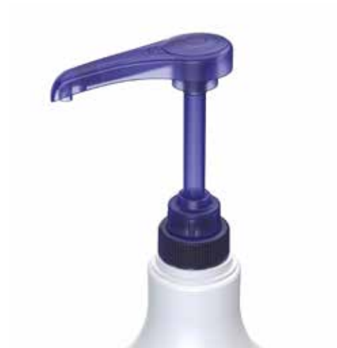
RS-10 Dispensing Pump