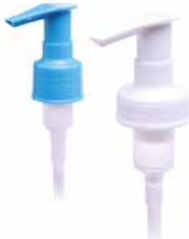
Nautilus Spring Pump Minimale Series