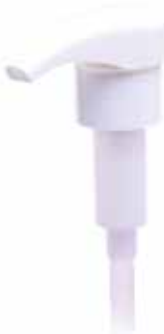
RS-3 Lotion Dispensing Pump RS Series