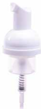
PF5 Dispensing Foamer