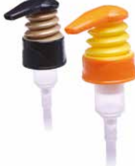
Bellow Press Pump Onda Series