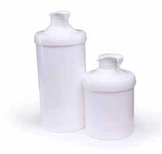
AVDS Airless High Viscosity System Wide