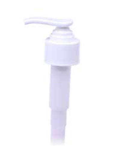
LDS-4 Lotion Dispensing Pump LDS Series