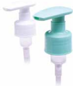
Nautilus Spring Pump Linfa Series