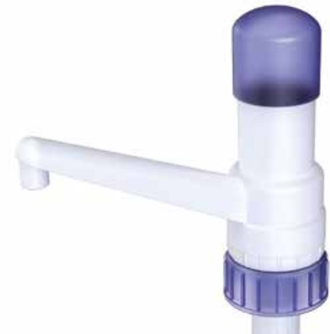
FND-30 Dispensing Pump