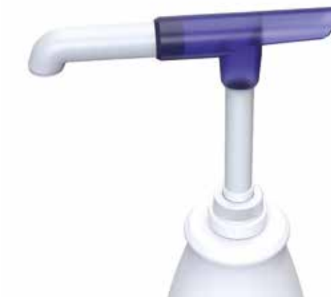
Maxi Dispensing Pump