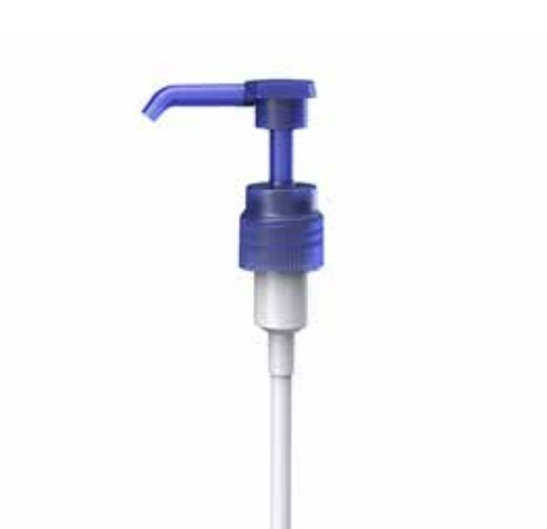
Stork (7.5cc) Dispensing Pump