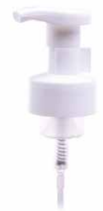
F16 Dispensing Foamer