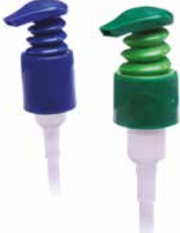
Bellow Press Pump Laguna Series