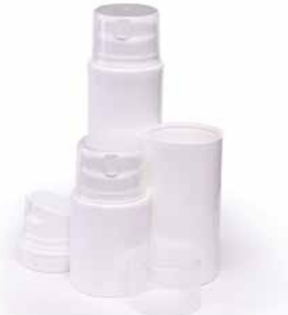
Airless Round Wide Dispenser