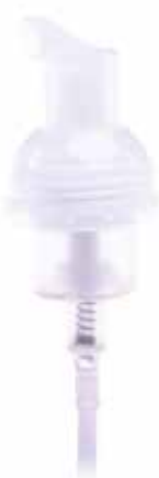
F12 Dispensing Foamer