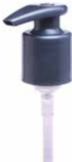
High Viscosity Pump Viscosa Series