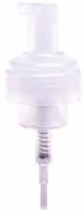
F2 Dispensing Foamer