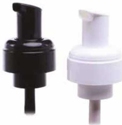
RF-08 Dispensing Foamer RF Series