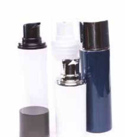
Selene Airless Dispenser