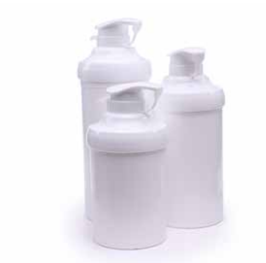
AVDS Airless High Viscosity System Slim