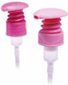
Bellow Palm Top Pump Goccia Series