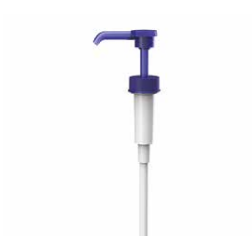
SC Falcon (4cc) Dispensing Pump