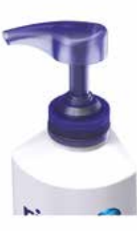
RS-3e Lotion Dispensing Pump RS Series