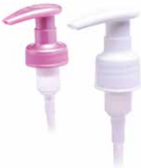
Nautilus Spring Pump Brezza Series