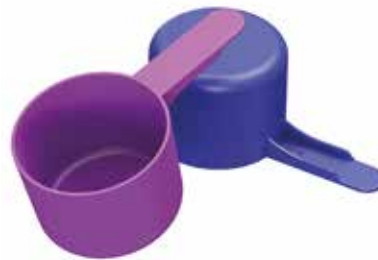
50cc Straight Wall Scoop Short 1.5 inch Handle