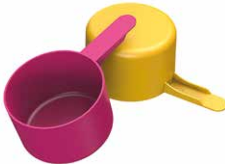
78.6cc Straight Wall Scoop Short 1.5 inch Handle