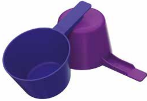
60cc Tapered Wall Scoop Short 1.5 inch Handle