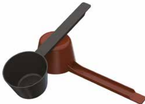
39cc Tapered Wall Scoop Long 3.5 inch Handle