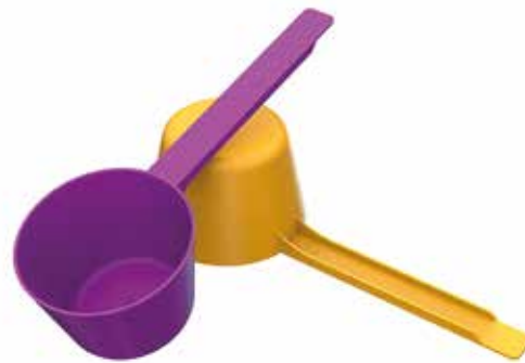
70cc Tapered Wall Scoop Long 3.5 inch Handle