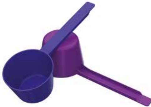
60cc Tapered Wall Scoop Long 3.5 inch Handle