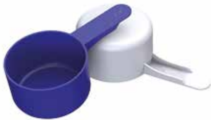
39cc Straight Wall Scoop Short 1.5 inch Handle