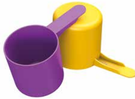
67cc Straight Wall Scoop Short 1.5 inch Handle