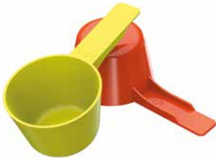
25cc Tapered Wall Scoop Short 1.5 inch Handle