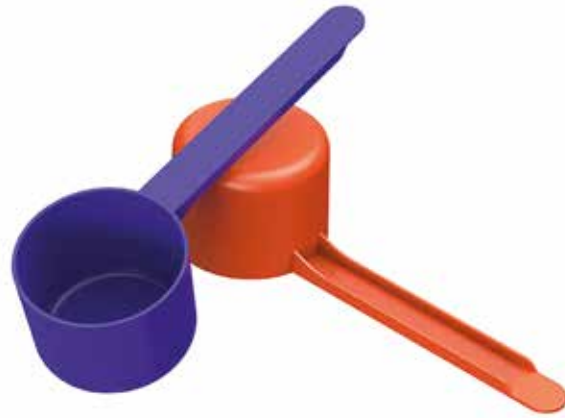
50cc Straight Wall Scoop Long 3.5 inch Handle