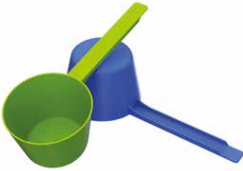
90cc Tapered Wall Scoop Long 3.5 inch Handle