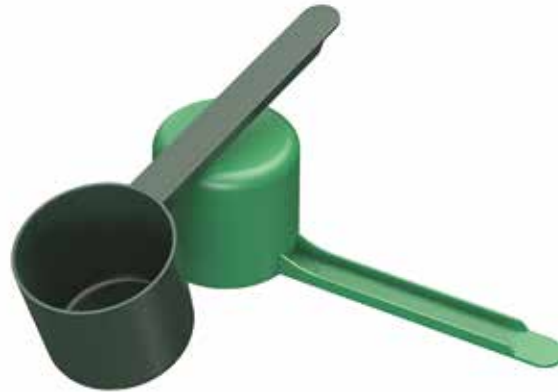
60cc Straight Wall Scoop Long 3.5 inch Handle