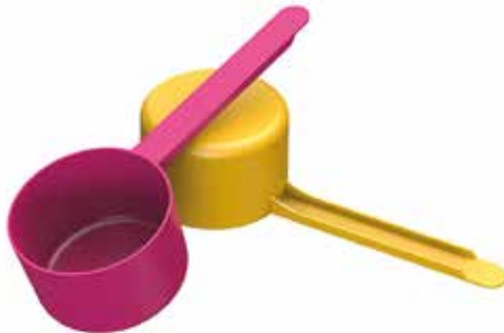
78.6cc Straight Wall Scoop Long 3.5 inch Handle