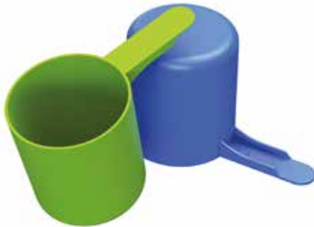
73cc Straight Wall Scoop Short 1.5 inch Handle