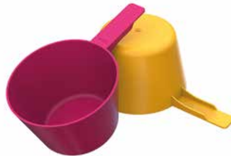
94cc Tapered Wall Scoop Short 1.5 inch Handle