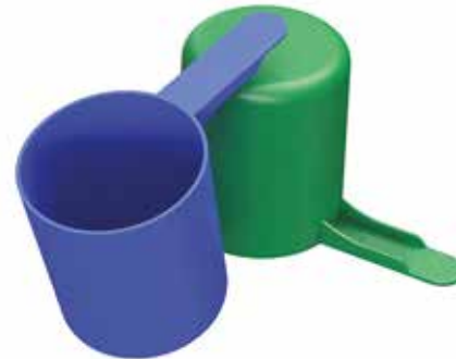
77cc Straight Wall Scoop Short 1.5 inch Handle