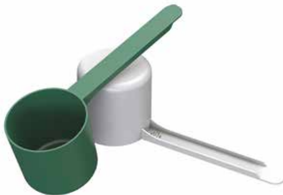
63cc Straight Wall Scoop Long 3.5 inch Handle