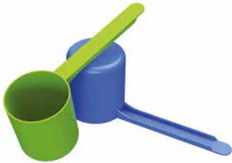
73cc Straight Wall Scoop Long 3.5 inch Handle