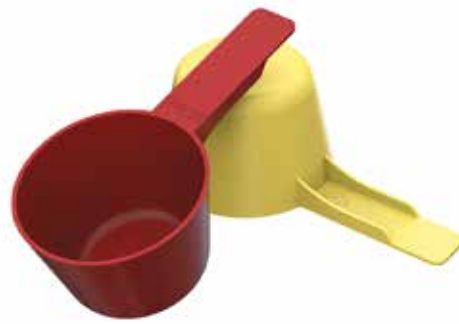
29.6cc Tapered Wall Scoop Short 1.5 inch Handle