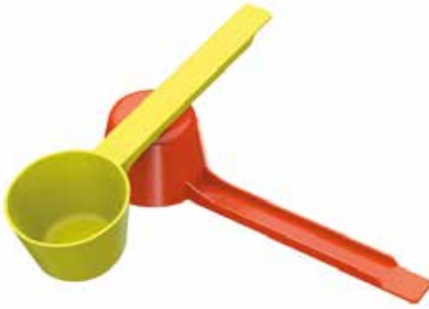
25cc Tapered Wall Scoop Long 3.5 inch Handle