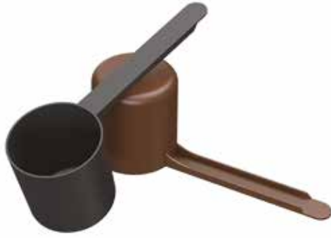
70cc Straight Wall Scoop Long 3.5 inch Handle