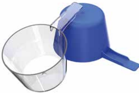
90cc Tapered Wall Scoop Short 1.5 inch Handle