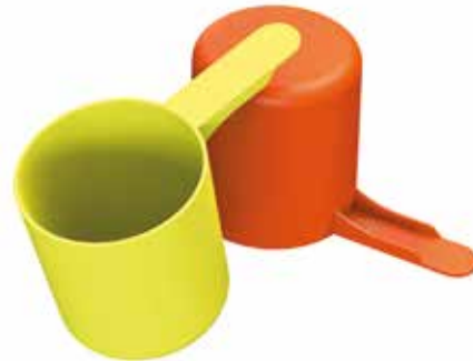
72cc Straight Wall Scoop Short 1.5 inch Handle