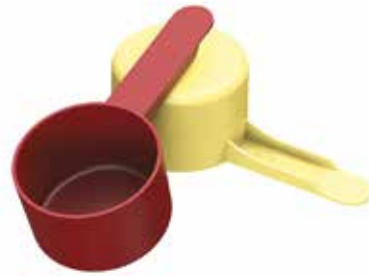
29.6cc Straight Wall Scoop Medium 1.7 inch Handle