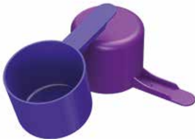
53cc Straight Wall Scoop Short 1.5 inch Handle