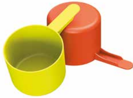
94cc Straight Wall Scoop Short 1.5 inch Handle