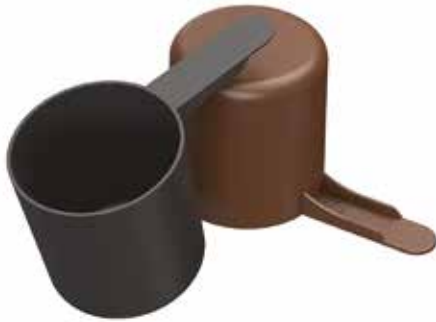
70cc Straight Wall Scoop Short 1.5 inch Handle