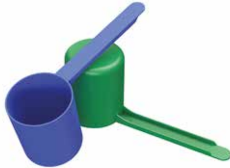
77cc Straight Wall Scoop Long 3.5 inch Handle