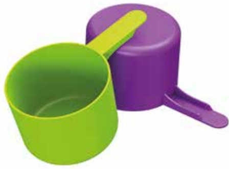
90cc Straight Wall Scoop Short 1.5 inch Handle