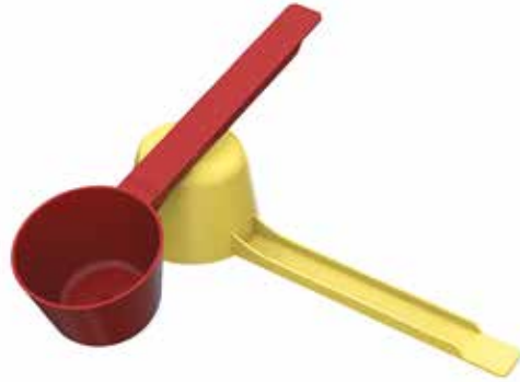
29.6cc Tapered Wall Scoop Long 3.5 inch Handle