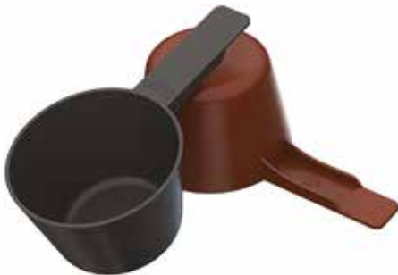
39cc Tapered Wall Scoop Short 1.5 inch Handle