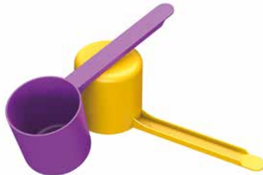
67cc Straight Wall Scoop Long 3.5 inch Handle