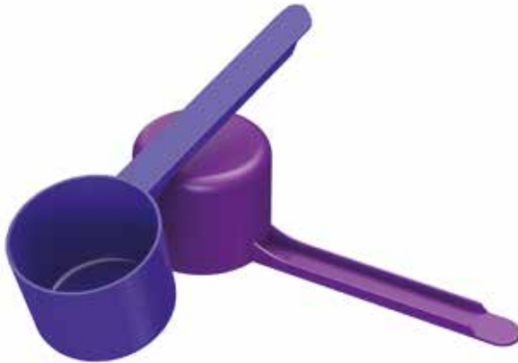
53cc Straight Wall Scoop Long 3.5 inch Handle