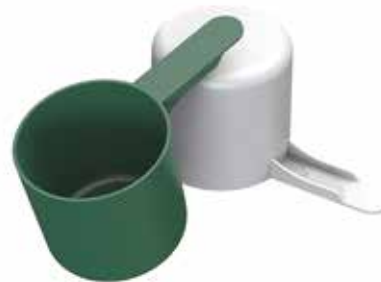
63cc Straight Wall Scoop Short 1.5 inch Handle