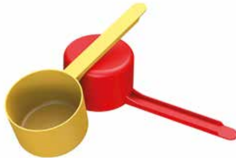
80cc Straight Wall Scoop Long 3.5 inch Handle