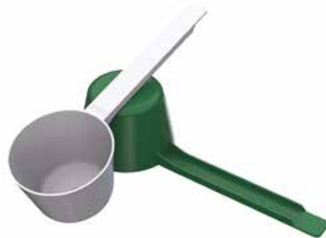
50cc Tapered Wall Scoop Long 3.5 inch Handle