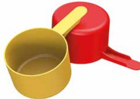
80cc Straight Wall Scoop Short 1.5 inch Handle