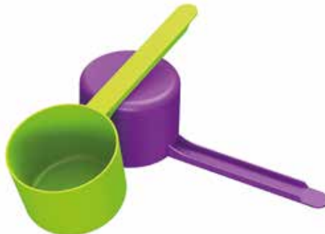
90cc Straight Wall Scoop Long 3.5 inch Handle