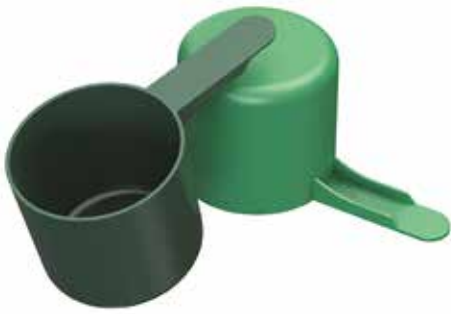
60cc Straight Wall Scoop Short 1.5 inch Handle