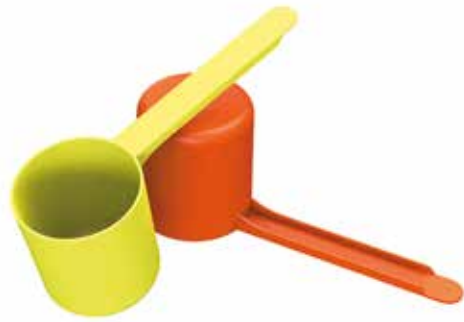
72cc Straight Wall Scoop Long 3.5 inch Handle