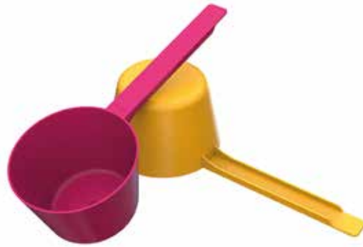
94cc Tapered Wall Scoop Long 3.5 inch Handle