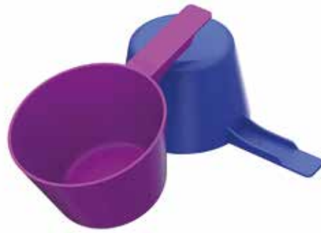
70cc Tapered Wall Scoop Short 1.5 inch Handle