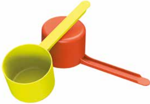
39cc Straight Wall Scoop Long 3.5 inch Handle