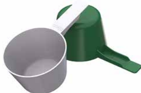
50cc Tapered Wall Scoop Short 1.5 inch Handle