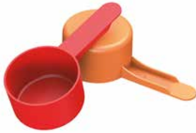
26.5cc Straight Wall Scoop Medium 1.7 inch Handle