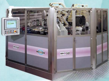
Omso, Italy Machine

And we are proud to inform that our business expansion plans for 2009 includes the addition of 8 Colour Stations Flexo Printing Machine by Omso, Italy and a 5-layers Extrusion, Compression-Heading Machine. At this juncture, we are building a new factory to accommodate our continuing expansion and modernisation.