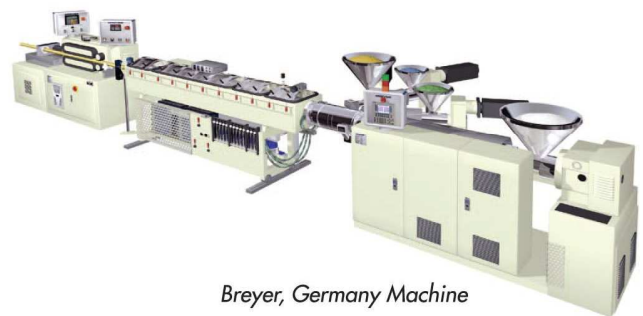
Breyer, Germany Machine