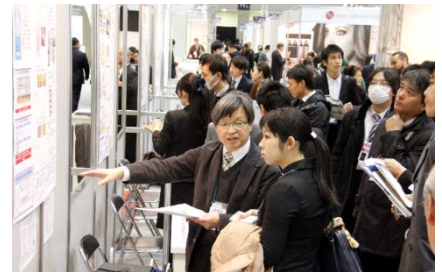
Academic Forum scene from 2017 show