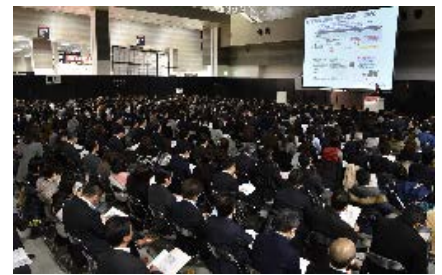
Conference scene from 2017 show

Also, the show has Innovative Cosmetics Ingredients Seminar venue and the Academic Forum which is located inside the exhibition hall will attract R&D professionals who are interested in the latest research of cosmetics ingredients.