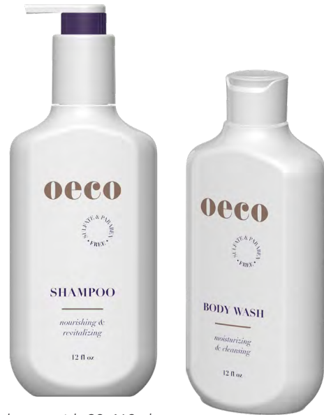
Bottles shown with 28-410 closures

This customizable flip-top not only addresses the need for a sustainable solution, but it is also ecommerce capable . The closure maintains the same neck finish as the 100% polyethylene pump to minimize the total bottle types needed.