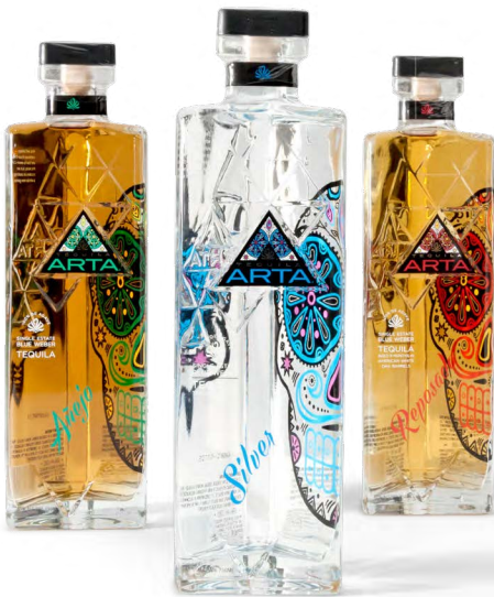
TricorBraun Success Story Arta Tequila

Concept designed for consumers, refined for manufacturability, available for final development.