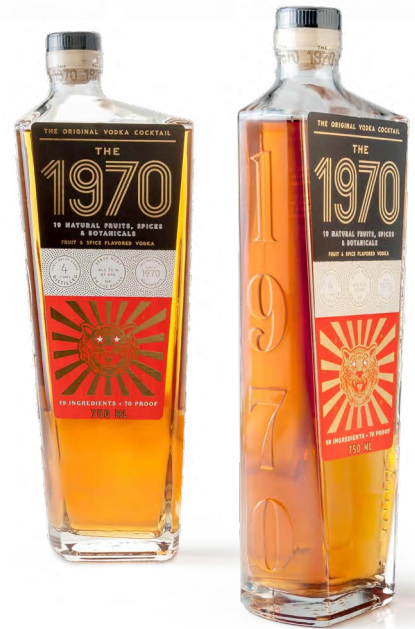
TricorBraun Success Story The 1970