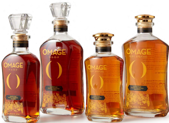
TricorBraun Success Story O'Neill Vintners & Distillery OMAGE