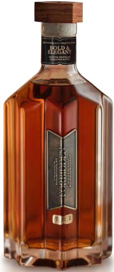
TricorBraun Success Story Forbidden Bourbon

Asymmetric, statuesque profile demands consumer attention