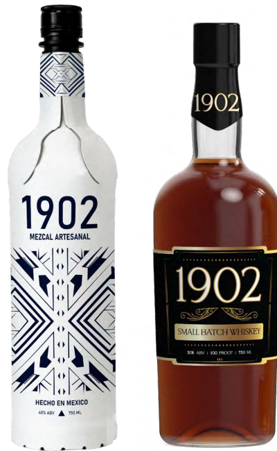
Paper bottle and eco-base bottle shown with concept artwork.

Recycled, recyclable or reduced material formats with on-pack messaging communicating the brand's story from the sourcing of the ingredients to the considerations for packaging.