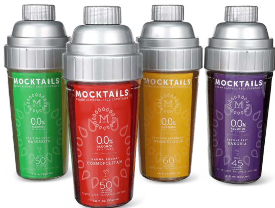
TricorBraun Success Story Mocktails

Lightweight options such as aluminum and plastic support portability. Value-sized offerings are often packaged in plastic with ergonomics built into the design. Glass continues to resonate as premium.