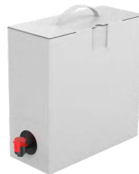
BAG IN BOX