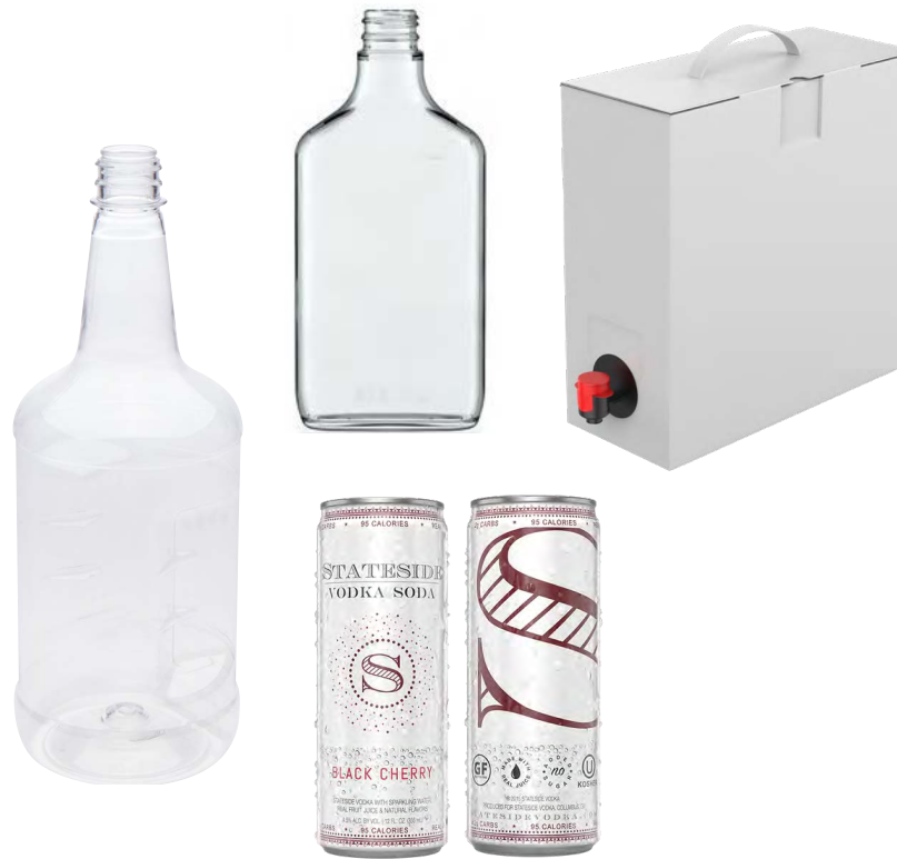
TricorBraun Success Story Stateside Vodka