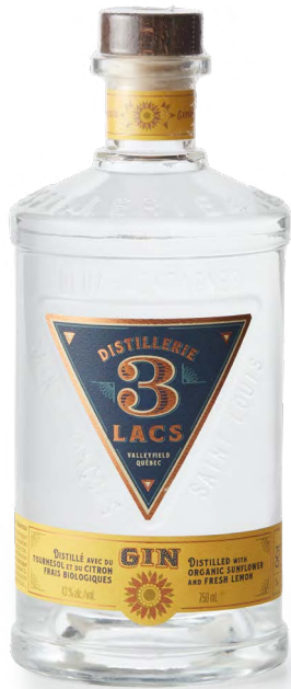
TricorBraun Success Story Distillerie 3 LACS