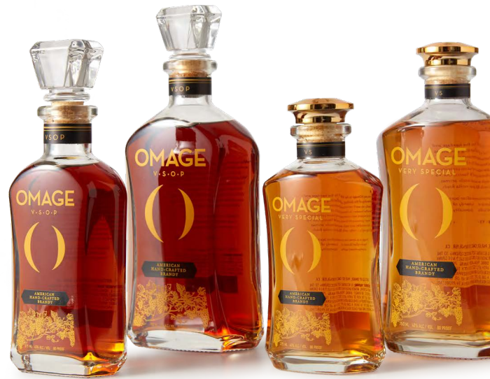
TricorBraun Success Story O'Neill Vintners & Distillery O'MAGE