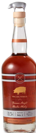
TricorBraun Success Story Peg Leg Porker